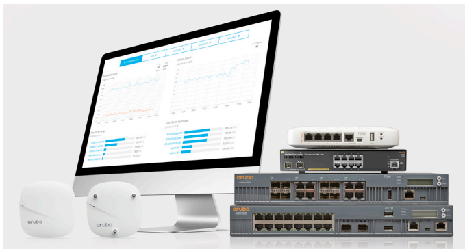
Aruba combines best-in-class wireless and wired infrastructure and management orchestration features with cost saving SD-WAN capabilities.

A Headend Gateway is needed for VPN concentrator (VPNC) termination in hub-and-spoke topologies for IPsec VPN tunnels, and in data center and campus routing scenarios.